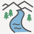
PUBLIC LANDS AND WATERS

BUILD BACK BETTER ACT: ✓ LCV priorities included ● LCV priorities partially included ✗ LCV priorities not included