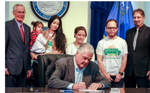
Governor Sisolak signing Nevada legislation.

IN NEVADA , Governor Sisolak signed legislation to fund incentives for school districts to transition to electric buses—a big win in a session that also expanded access to solar power for low-income families and saw the passage of a statewide 50 percent renewable energy standard.